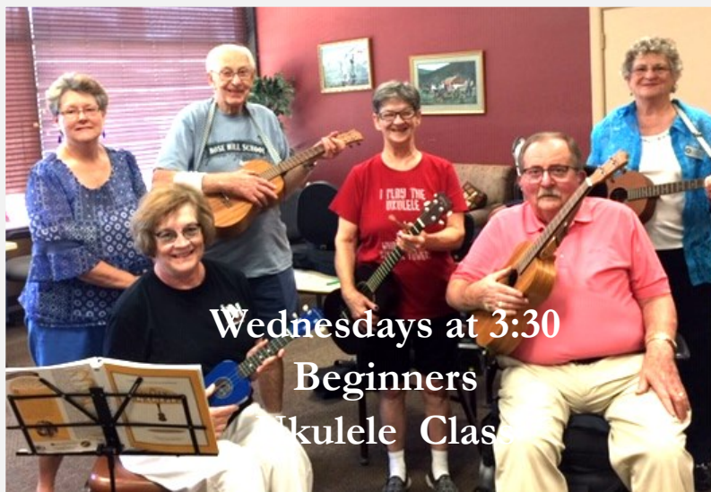
Wednesdays at 3:30 Beginners Ukulele Class

You're never too old to learn something new, especially if it is some- thing you enjoy.