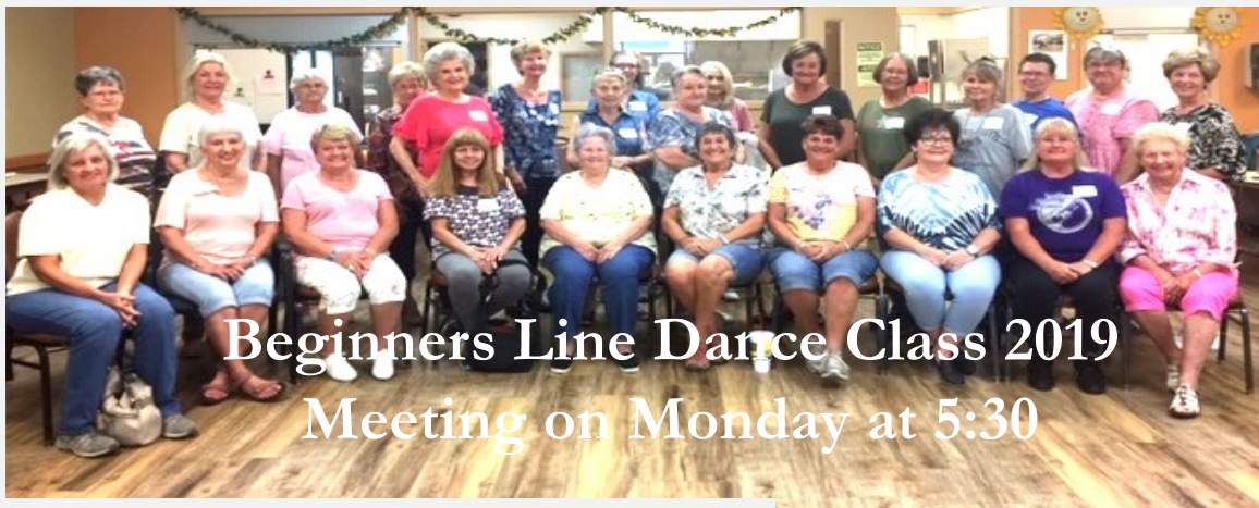
Beginners Line Dance Class 2019 Meeting on Monday at 5:30

Flu Shots available on Friday, October 4th 10-12:00 Bring your Medicare Card.